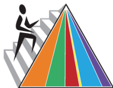
Successful Students Through Healthy Foods & Fitness

"School staff shall encourage parents/guardians or other volunteers to support student wellness by considering nutritional quality when selecting snacks for class parties and limiting foods or beverages that do not meet nutritional standards. Class parties or celebrations in elementary schools shall be held after the lunch period when possible."